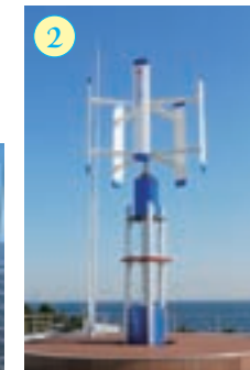
Wind power generator