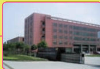
Changzhou Ruiyang Transmission Technology Co., Ltd. (Changzhou, Jiangsu Province)