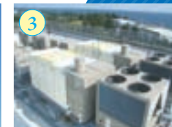
Ice thermal energy storage system

Looking ahead, Toyo Denki will contribute to the development of society by delivering a host of products and systems to its customers both in Japan and overseas that address increasingly diversified and sophisticated needs.