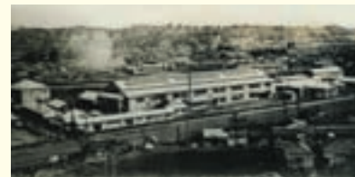
The Yokohama Works at its initial opening (Hodogaya-ku, Yokohama City)

Overview of the Yokohama Works Address: 3-8 Fukuura, Kanazawa-ku, Yokohama City Site area: 55,300m 2 Total building floor area: 42,575m 2 Greenery area: 8,800m 2 (Ratio to total area: 15%)