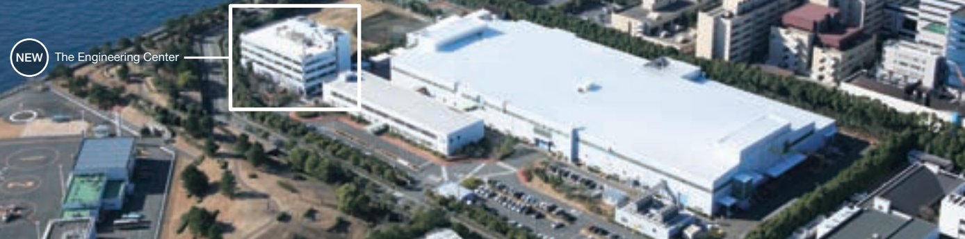
NEW The Engineering Center

In order to improve our development and design capabilities while at the same time upgrading and expanding our production capacity, we pushed forward with steps to redesign our Yokohama Works, the Group's principal manufacturing base. In this Special Feature, we introduce readers to a portion of this redesign, focusing largely on the construction of the Engineering Center.