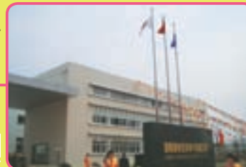
Hunan XiangYang Electric Co., Ltd. (Changsha, Hunan Province)