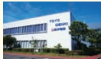
The current Yokohama Works (Kanazawa-ku, Yokohama City)

The Works was relocated to its present site in Kanazawa-ku, Yokohama City in 1985. At that time, steps were taken to renew the facilities and manufacturing systems, which was relaunching as a leading-edge facility of its day.