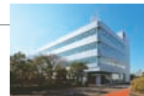
Panoramic view of the Engineering Center

Overview of the Engineering Center Total floor area: 5,755m 2 Structure: Five-story, reinforced-concrete structure