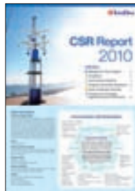
CSR Report 2010

Toyo Denki's CSR Report 2010 was posted in Japanese on its website in July 2010. Toyo Denki is committed to contributing to society by delivering products and services that help to conserve energy and resources. At the same time, the Company engages in wide-ranging environmental contribution activities. This report and other information are posted online in an effort to provide readers with a better understanding of the Company's CSR activities.