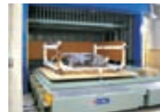
A newly installed lift made possible by the increased production space

In relocating the development and design functions to the Engineering Center, space available for production at the Yokohama Works increased by 12%. Together with the upgrade and expansion of facilities, production capacity improved by approximately 36%. The total investment cost in constructing the Engineering Center and redesigning the Works amounted to approximately 1.6 billion yen.